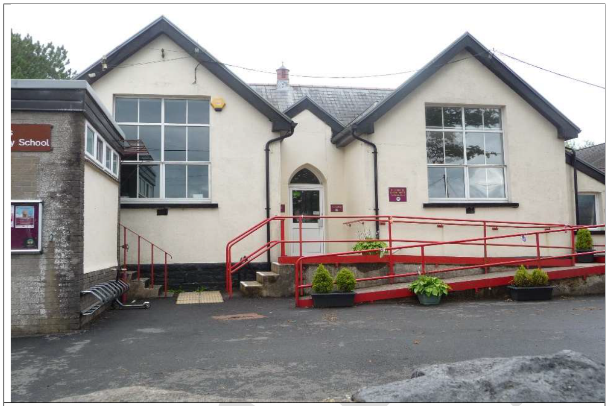
External view of Rhigos Primary School.