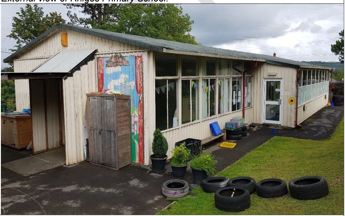
External view of the metal prefabricated building